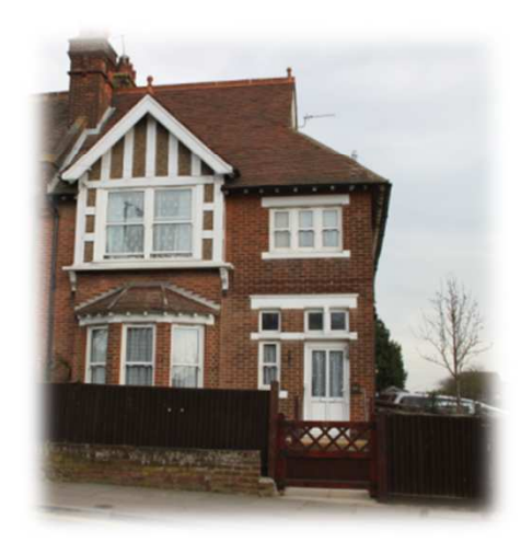
Canterbury ASU – Canterbury 5 Bedded Unit