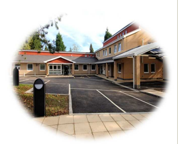
Sunrise Centre – Southborough 6 Bedded Unit