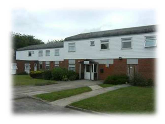
Osborne Court – Faversham 13 Bedded Unit