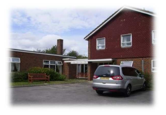
Southfields – Ashford 15 Bedded Unit