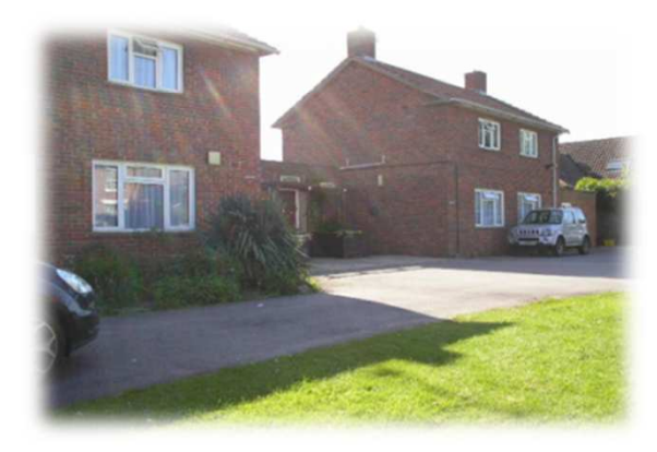
Hedgerows Staplehurst 5 Bedded Unit